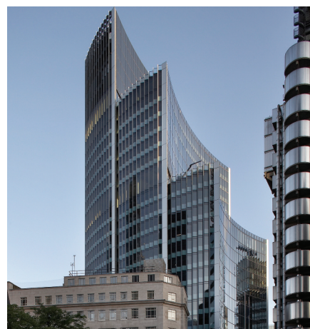
© Stanhope by Hufton + Crow

Tel: +44 (0)20 3124 7599 Email: hodsonj@willis.com